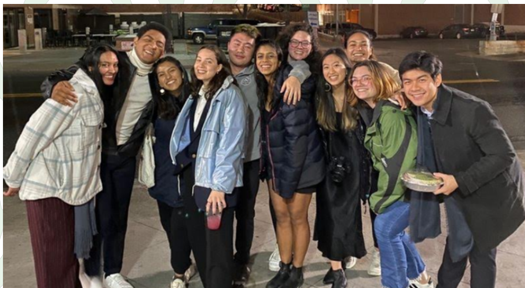
2022 Fall Formal!

We are happy to help you and your class members to connect with venues and the alumni office for your special gathering. Reach out to hanoverv23@gmail.com or secretary@casqueandgauntletsociety.org