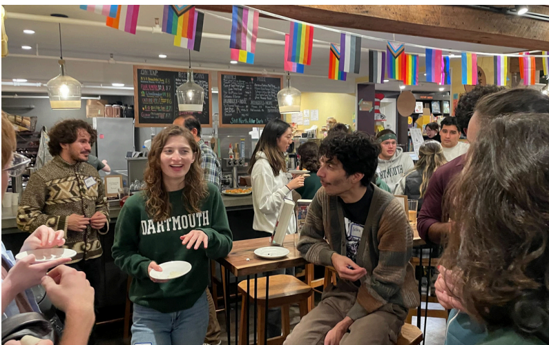
C&G Homecoming 2024 was held at Still North Books and Bar in Downtown Hanover.