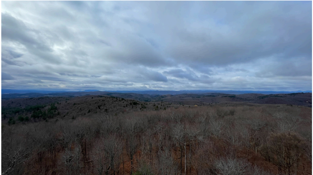
Perfectly gloomy fall weather at the top of Mount Gile in Norwich

HOMECOMING 2024 | ANNUAL DUES AND DONATIONS